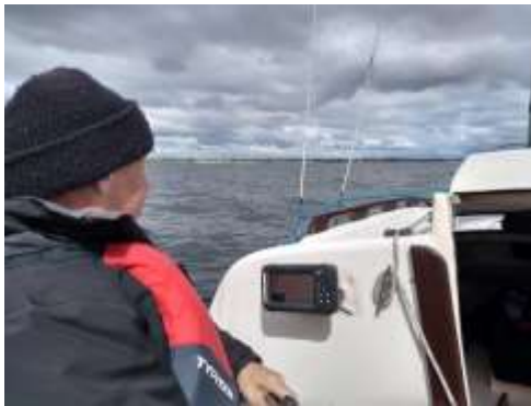
Balintore in sight

We were unable to get in touch with the harbour master at Balintore, so could not obtain information about depth in Balintore harbour. Although there was a website, there was no useful information on the Internet about Balintore harbour.