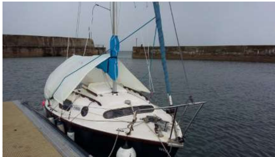
Prototype boom tent erected

As the weather was fair and sunny, we set off for a walk around the sprawling metropolis of Balintore/Shandwick/Hilton. A very pleasant experience! We walked along to the Mermaid of the North, a large bronze statue of a mermaid which I think looks every bit as impressive as that of Copenhagen, but with a lot less travelling involved. We then set off along the fine sandy beach of Shandwick, where a number of people were enjoying the water. Some with wetsuits, some without. Even if not coming by boat, I think the villages are well worth a visit.