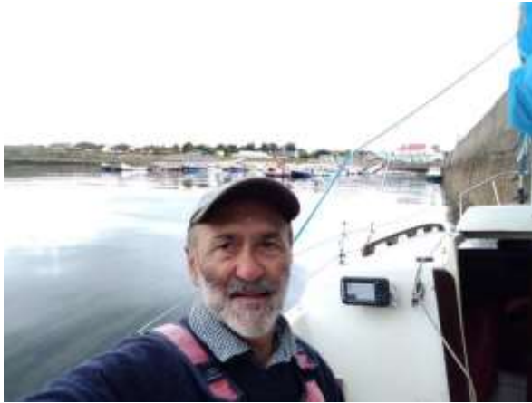
Safely in Balintore

We watched the level rise, in the harbour, and reckoned we could have a try at entry. Wisp really only draws 0.6M. Time was around 14:00, some 4 hours before HW. Keeping close to the harbour wall and watching the depth sounder, we got to the first ladder on the harbour wall.