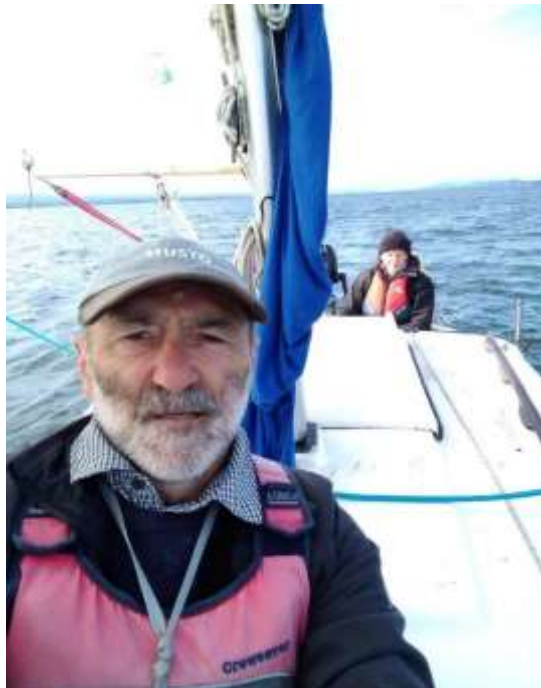
On our way

Distance 15 Nm. Time for journey @3Knts = 5 hours