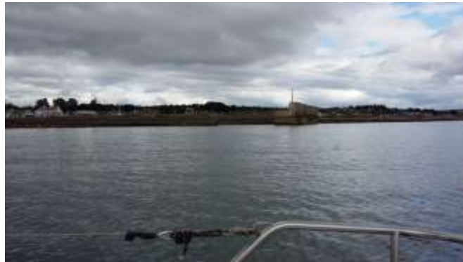
Balintore harbour entrance

On arrival at Balintore we tried calling the number of the harbour master, but to no avail, so we tried calling "any boats in Balintore harbour" on Channel 16. One boat, "Happy Days", replied and based upon our draught of 1M, they were able to suggest that 16:00 might be the earliest we could safely enter Balintore harbour. As it was only 12:45, and low tide, we anchored off the harbour mouth to await a rise in the tide. The boat was tidied and lunch was eaten, whilst we waited.