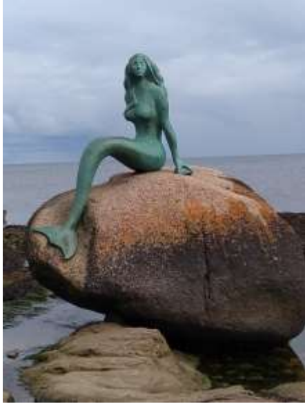
Mermaid of the North