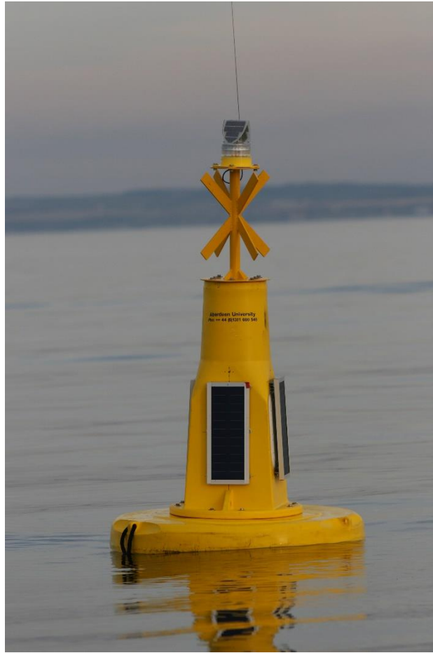
Hydrophone buoy, as deployed.