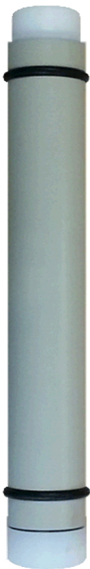
Acoustic logger (600 x 95mm)