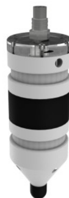
Sound recorder (200 x 60mm)

Examples of equipment which the above moorings support.