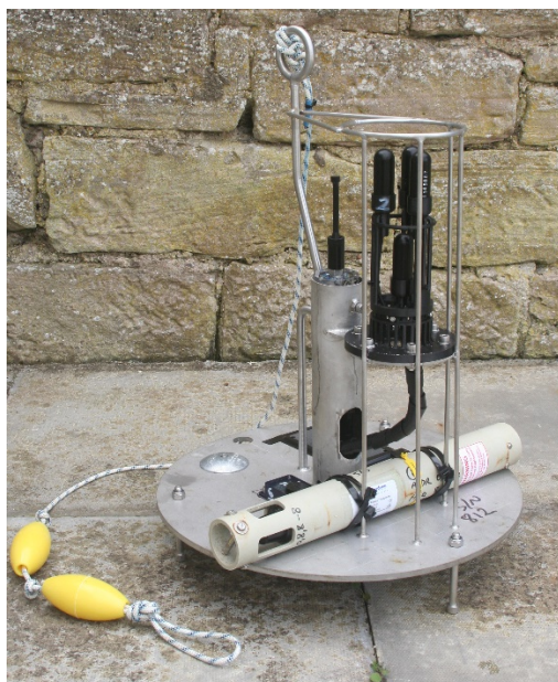
Lander (700 x 500mm)