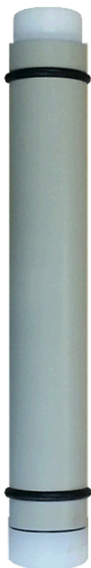
Acoustic logger (600 x 95mm)