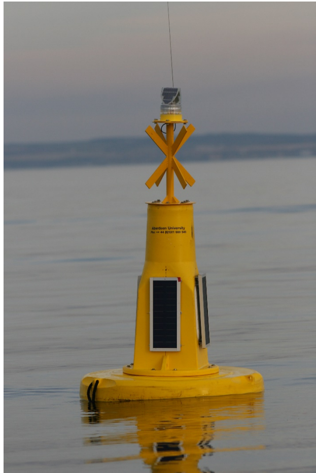
Hydrophone buoy, as deployed.