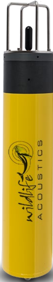
Sound recorder (900 x 170mm)