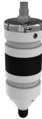
Sound recorder (200 x 60mm)

Examples of equipment which the above moorings support.