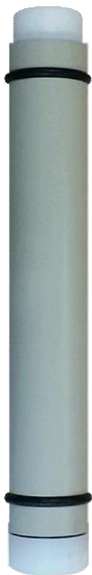
Acoustic logger (600 x 95mm)