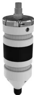
Sound recorder (200 x 60mm)

Examples of equipment which the above moorings support.