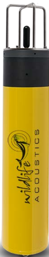
Sound recorder (900 x 170mm)