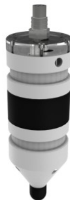
Sound recorder (200 x 60mm)

Examples of equipment which the above moorings support.