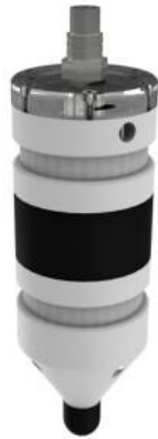
Sound recorder (200 x 60mm)