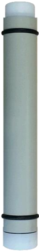
Acoustic logger (600 x 95mm)