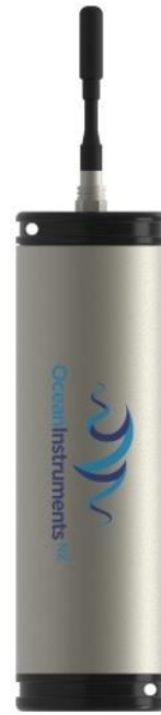
Sound recorder (350 x 100mm)

Examples of equipment which the above moorings support.