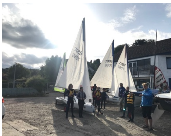
Thursday evening Dolphins preparing to sail

The training season was noticeably busy with 35 RYA certificates issued. Junior dinghy sailing was very buoyant with 14 attending Junior Week, a further 6 attending a Stage 1 course and sign-ups for 95 individual Dolphins sessions.