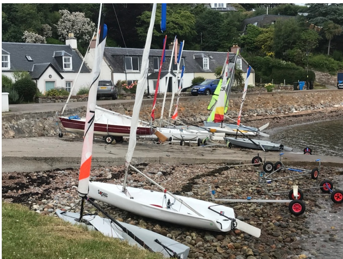
Dinghies ashore for lunch during junior week

Conveyancing the deeds and assigning the Harbour, Dinghy Park and Slipway lease from the unincorporated Community Amateur Sports Club (CASC) to the SCIO was very close to being concluded by the end of this reporting period. Hence the wind up of the unincorporated CASC was nearing completion.