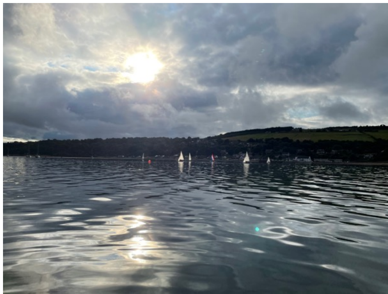
A tranquil summer Friday evening recreational sail

The trustees will therefore prioritise actions that will facilitate and support these priorities, by means of regular board meetings and working groups, including holding the AGM in December 2021 where trustees will be elected to the board by and from the membership.