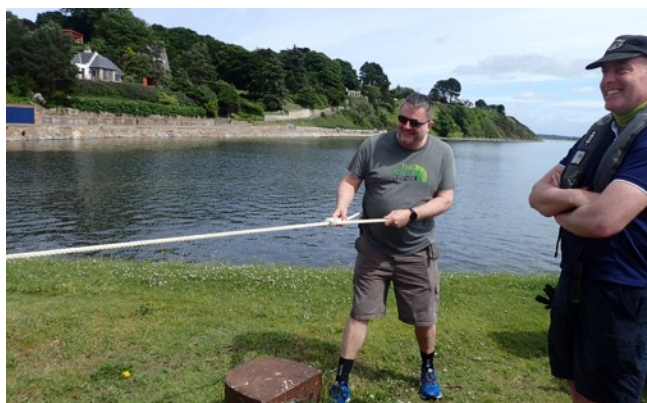
Knot-tying at cox training

A prolonged period of adult dinghy training was completed in September with 2 sailors achieving their Level 2 certificates. Two Powerboat Level 2 courses (9 students total) were run plus a Safety Boat skills one-day session (5 students). Rowing cox training, as a mixture of Zoom theory and on-the-water practical, was delivered twice for a total of 17 rowers. Four Dinghy Instructors attended their Part 2 DI in September completing their DI training which had been disrupted by Covid RYA mitigation measures.