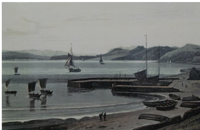
Fortrose Harbour 1817