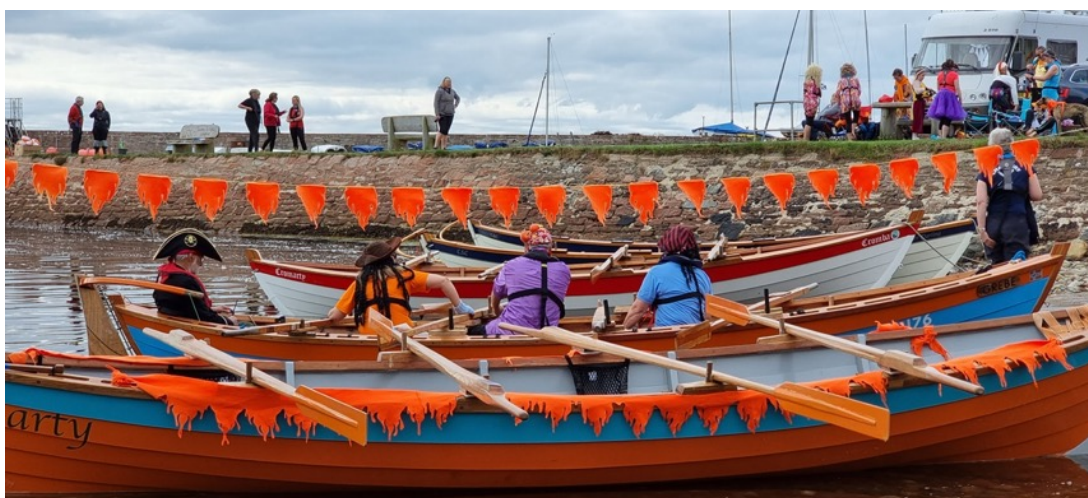
St Ayles skiffs from neighbouring communities at our UnRegatta