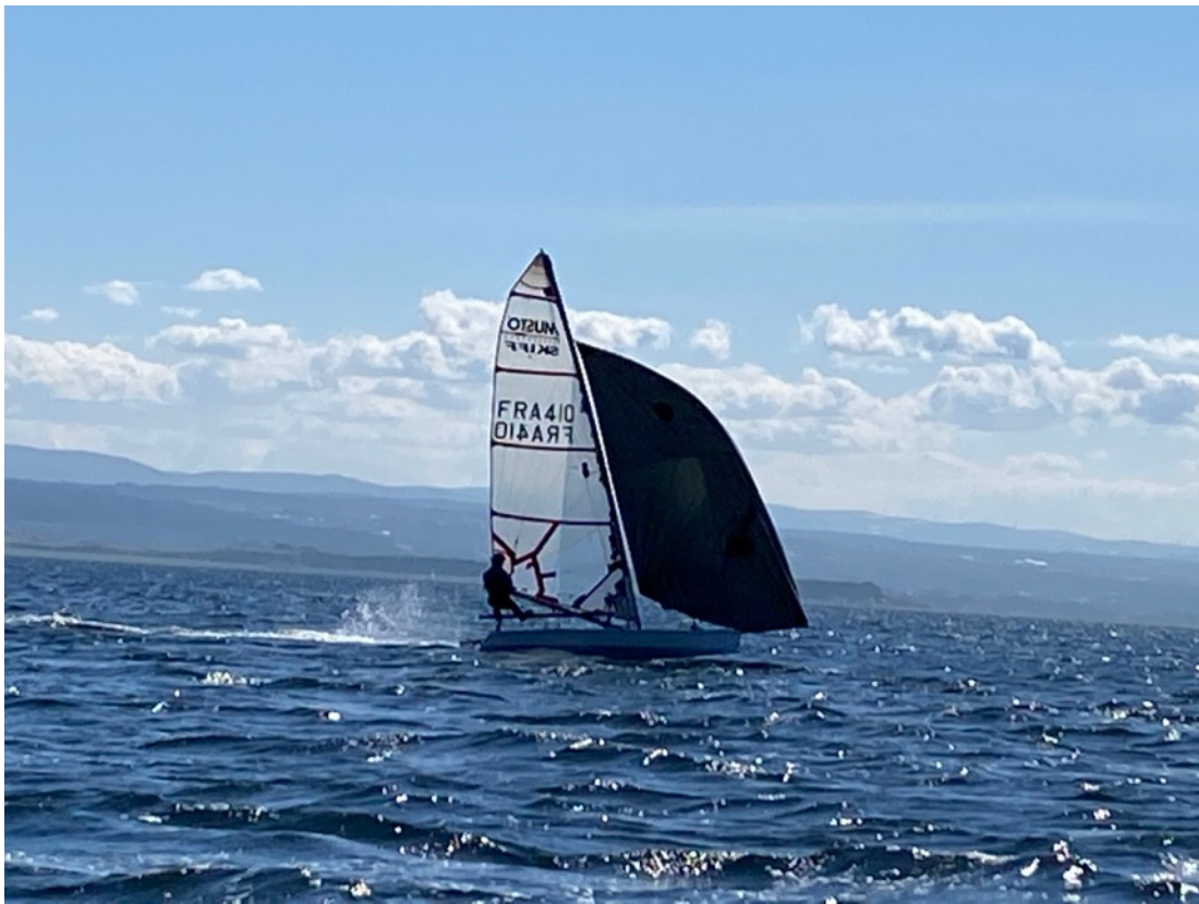
Musto skiff having a blast