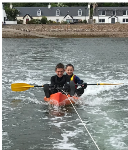
Fun and games at the end of junior week