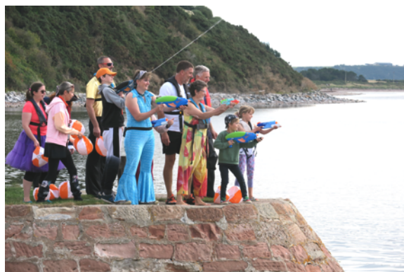
UnRegatta fun with water pistols

Come and Try Rowing Sessions and other opportunities to try rowing generated several new club members, who were welcomed by an improved induction process. More rowing sessions were delivered as a result of training five new coxes, and we were able to deliver a more varied programme of rowing. Club rowers took part in two local regattas, plus the RowAround Scotland legs from Cromarty to Fortrose and Fortrose to Ardersier. We held our own local fun UnRegatta in September which was a great success.