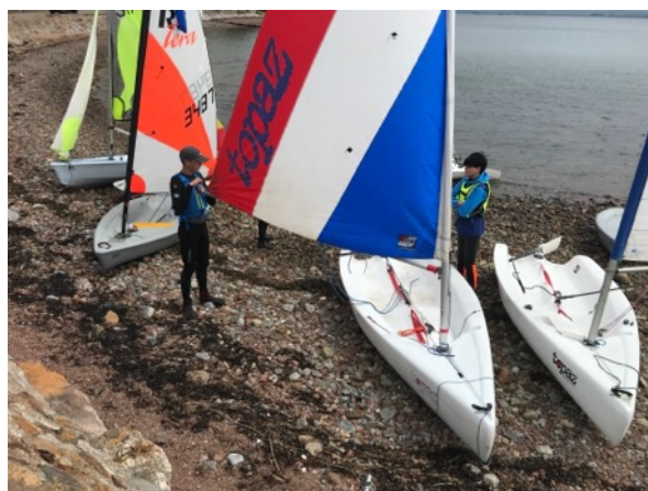
Sorting out a sail at junior week